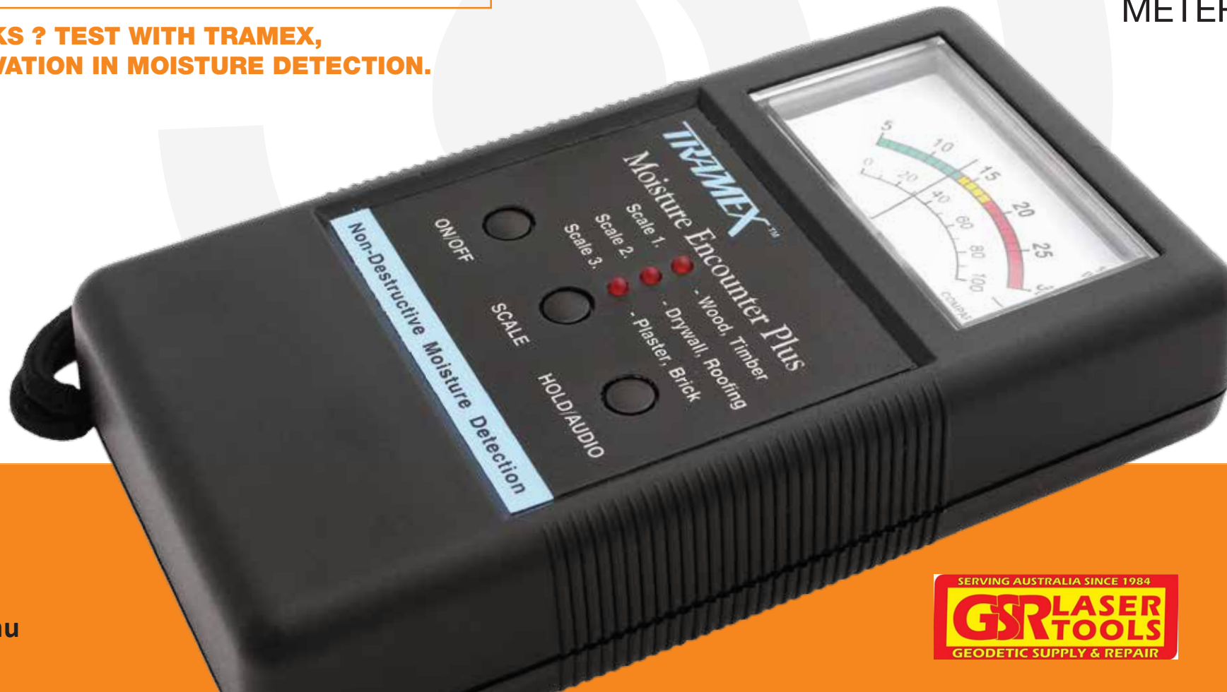
WATER DAMAGE - EU 05/14 REV.1.1

GSR Laser Tools Unit 7 / 7 Prindiville Drive - Wangara WA 6065 Ph: 08 9409 4058 sales@gsrlasertools.com.au - www.gsrlasertools.com.au