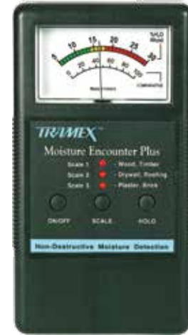
Product order code: MEP