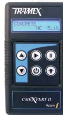
Product order code: CMEX2