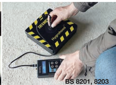
BS 8201, 8203