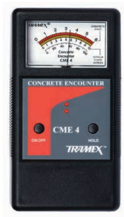
Product order code: CME4