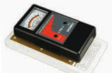
CME4 Calibration check plate CALCRH