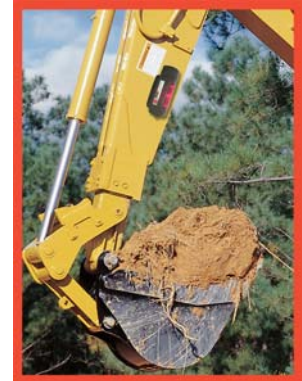
MP2 mounted to a backhoe boom