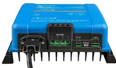
Phoenix Smart 12/50(3)