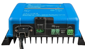
Phoenix Smart 12/50(1+1)