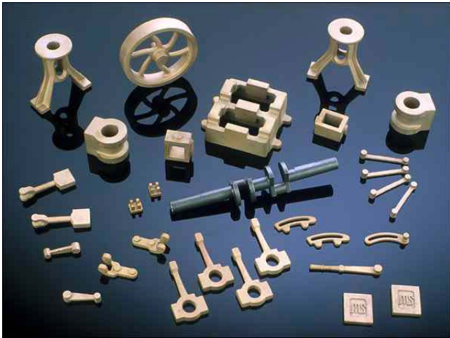
4. Reversing Casting Kit for Machining