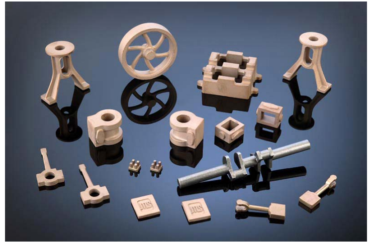
5. Non Reversing Casting Kit for Machining