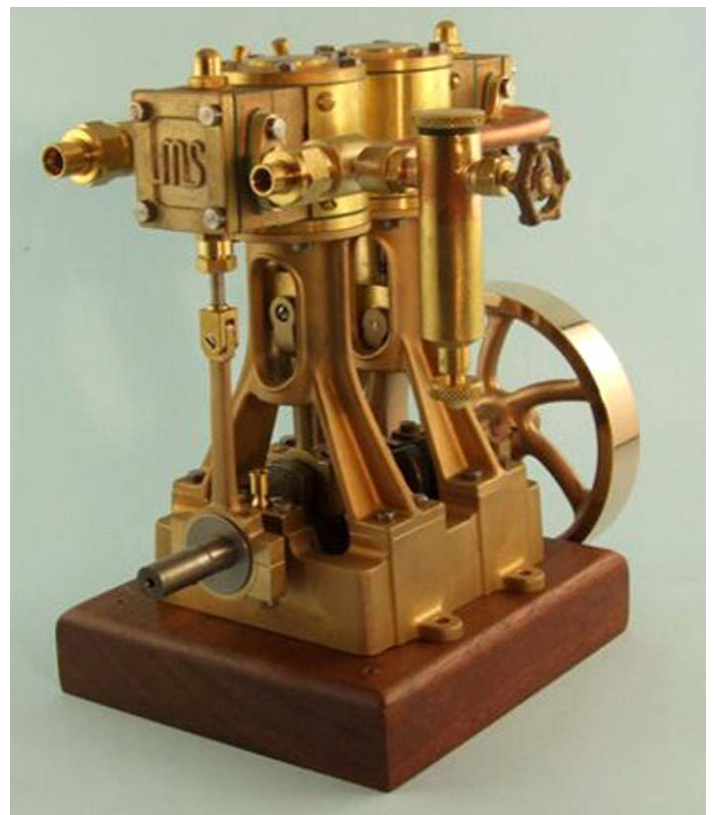
3. Fully Assembled Non Reversing Engine