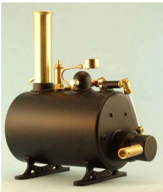
"Miniature Steam" 4 Inch Horizontal Boiler

The "Miniature Steam" Mildura steam engine is made from highest quality materials. The cast components are made from a combination of bronze and copper based marine grade alloy using the lost wax (investment) casting process. This casting process produces a super fine surface finish in combination with accuracy of detail and dimension. The fully balanced crankshaft is made from Spheroidal Graphite (S G) cast iron to achieve optimum mechanical properties. The remainder of the machined components are made from brass and stainless steel. This combination of alloys provides maximum protection from corrosion and durability during service life of the steam engine.