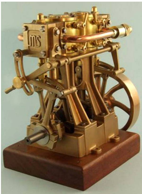
2. Fully Assembled Engine with Manually Operated Reversing