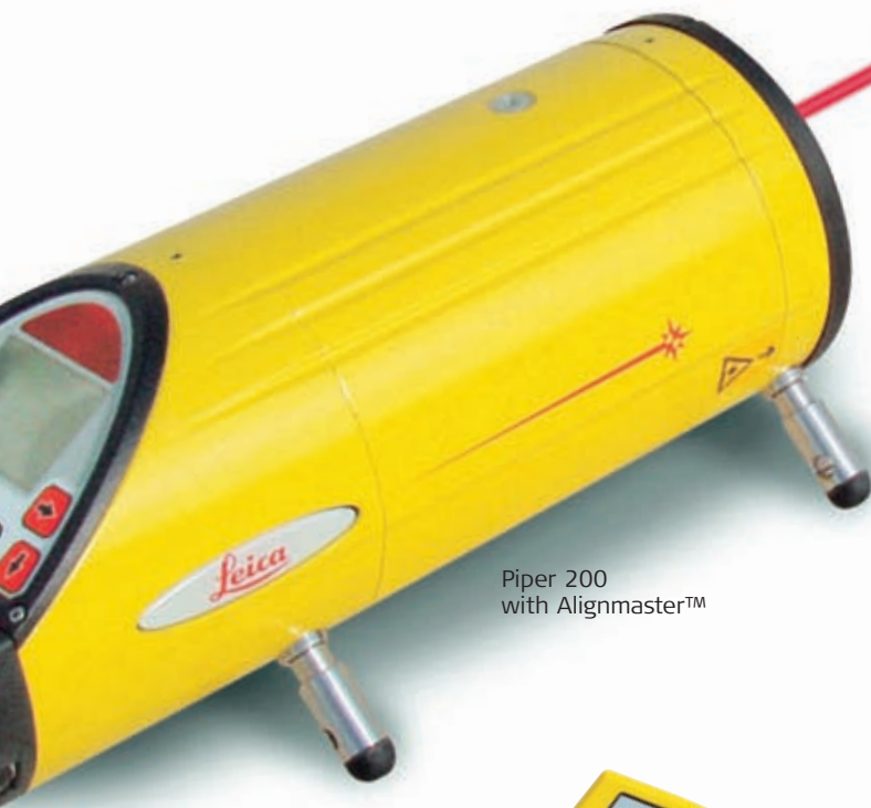
Piper 200 with Alignmaster™

Piper 200 with Alignmaster™ Patented automatic targeting system searches and finds the target for second day setups.