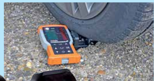
Tough Heavy Duty Clamp