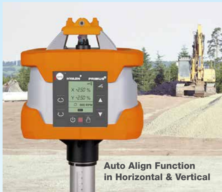
Auto Align Function in Horizontal & Vertical

Visit www.nedo.com then look at Nedo TV for video tutorials of "How to use" the Auto Align function in Horz & Vert