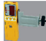
Outdoor Receiver with Staff clamp